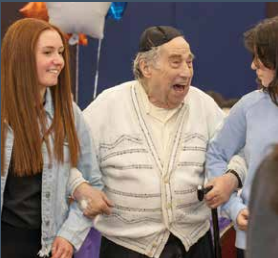
Before the pandemic, Holocaust survivors gathered at Green Road Synagogue to celebrate Chanukah and enjoy the company of friends and volunteer students from Fuchs Mizrachi School.