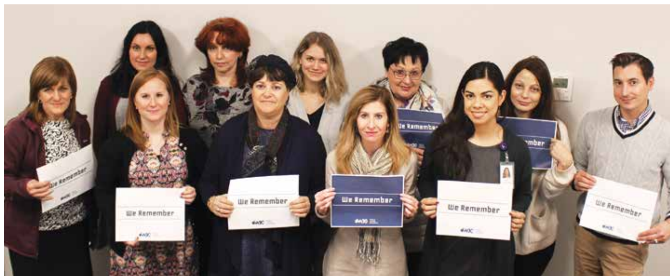
Older Adult Services staff help promote the World Jewish Congress #WeRemember Campaign which aims to combat antisemitism and all forms of hatred, genocide and xenophobia.